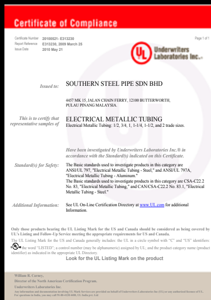
EMT Certificate from UL