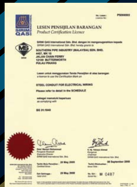
BS 31:1940 Certificate from SIRIM QAS

The many certifications garnered through the years are testament to the companies' steadfast commitment in providing only the best products & services. Among others, it has the distinction of being the first steel mill in the country to be awarded the ISO 9001:2000 certification. The group's product lines were being exported to countries all over the world.