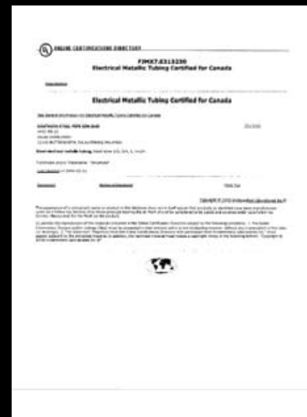
EMT Certificate from UL for Canada