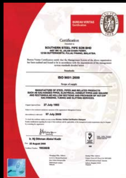
ISO 9001:2000 Certificate from Bureau Veritas