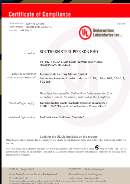
IMC Certificate from UL