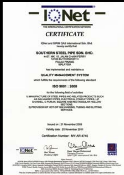
ISO 9001:2000 Certificate from SIRIM QAS