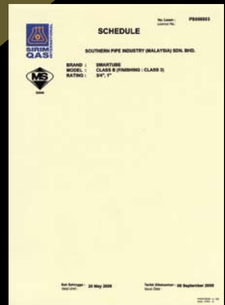
BS 31:1940 Certificate from SIRIM QAS